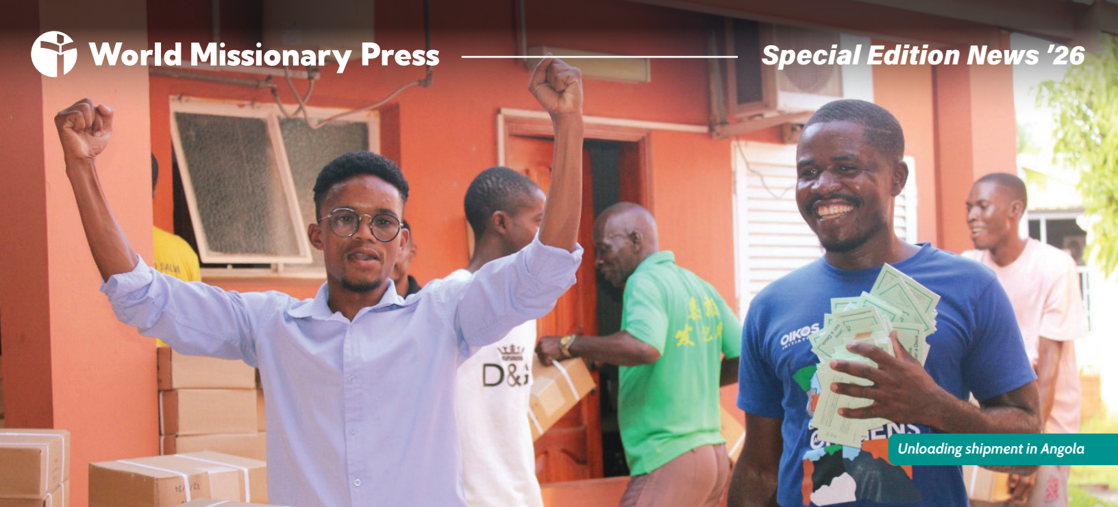
Unloading shipment in Angola