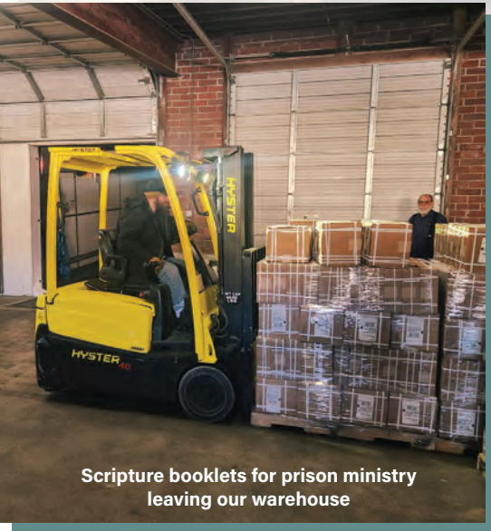
Scripture booklets for prison ministry leaving our warehouse

A time-warp away from the stresses of prison life