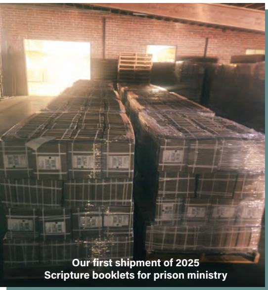
Our first shipment of 2025 Scripture booklets for prison ministry

In the words of Jesus "...I was in prison and you came to Me" (Matthew 25:36). For years, we have supported churches and ministries with tools to share God's Word with prisoners around the country. We're expanding our reach even further with those who do prison ministry through our new program, WMP: UNBound . WMP is fortunate to have partners like you, enabling the establishment of a specialized department focused on supporting prison chaplains, prison ministries, and inmates. This past year, we printed 750,000 Scripture-text Datebooks as part of our commitment to expand our outreach to approximately 1.9 million individuals across 6,245 correctional facilities in the United States and Puerto Rico.