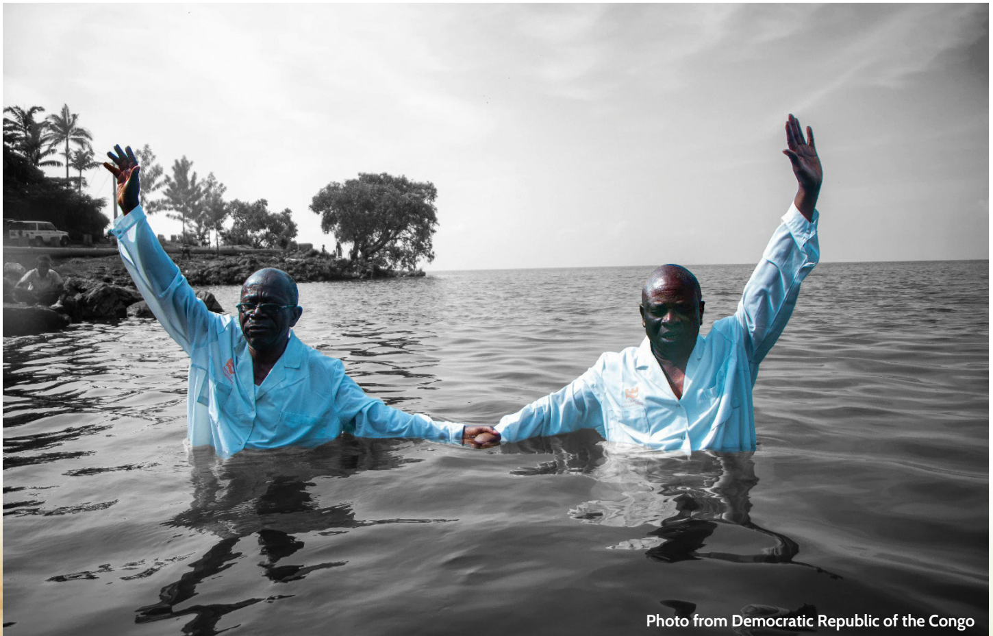
Photo from Democratic Republic of the Congo

That day, I felt something indescribable, as if Heaven had opened for me. In a leap of faith, I confessed my sins and decided to follow Jesus Christ for the rest of my life. Since then, I have walked this new path with a peace I had never known before, determined to live according to Christ’s teachings. Today, this church supports and guides me in this new life, and I am learning each day to follow in the footsteps of Jesus Christ and to grow in faith.”