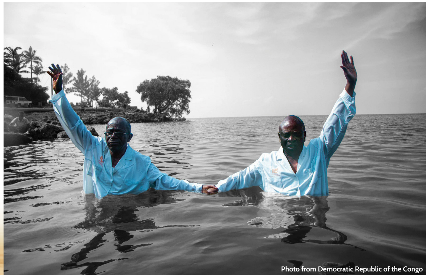
Photo from Democratic Republic of the Congo