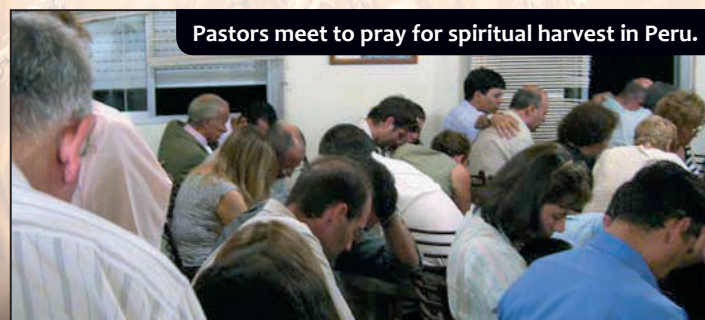
Pastors meet to pray for spiritual harvest in Peru.