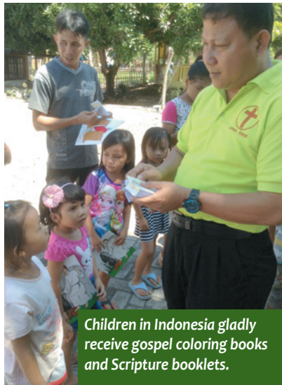
Children in Indonesia gladly receive gospel coloring books and Scripture booklets.

Distribution of Christian literature is a major factor in evangelism among the 1.2 billion people of India. Of a reported 456 languages in India, 18 have more than 10 million speakers. By providing free Scripture booklets in more than 40 languages of India, WMP helps arm evangelists and pastors to reach village after village with the message of hope. Containers were recently shipped to Serve India Ministries and Operation Mobilization. Shipments are currently in production for Every Home for Christ and a new WMP major distributor in Kerala State. 🌐