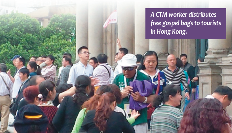
A CTM worker distributes free gospel bags to tourists in Hong Kong.