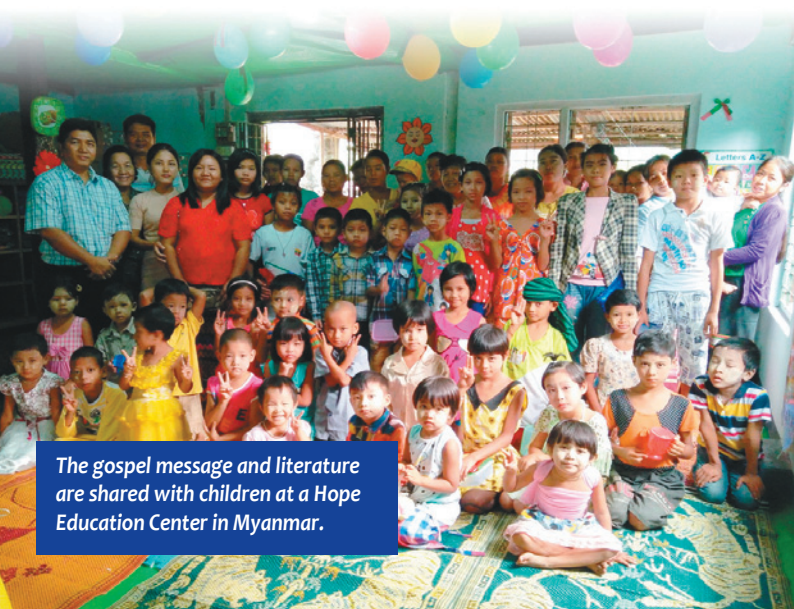
The gospel message and literature are shared with children at a Hope Education Center in Myanmar.