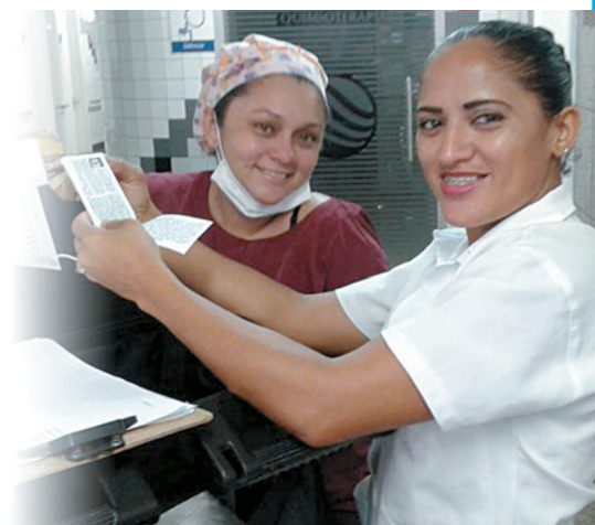
People in Brazil receive and read Scripture booklets in a hospital waiting room.