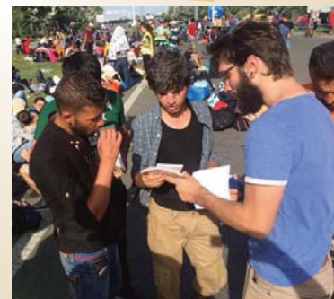
Muslim refugees receive Arabic Scriptures along with food and clothes.

As the immigrant situation has intensified in Europe, pleas for WMP Scripture booklets have increased from several churches in Hungary who are reaching out to Muslim refugees from Syria and Afghanistan.