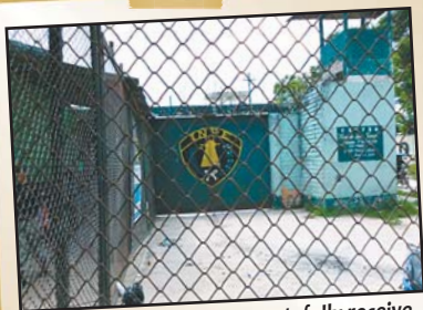
Inmates in Iquitos prison gratefully receive Scripture booklets in their own language.