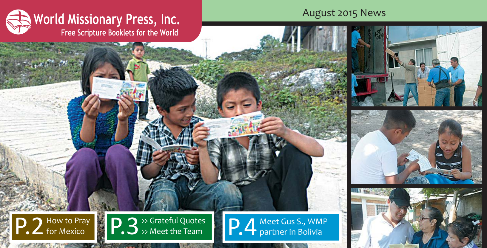
Souls of all ages eagerly receive and read God's Word throughout Latin America. Praise God for providing funds and distributors to sow the eternal seed of His Good News!