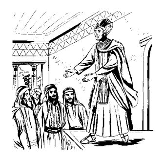
Genesis 45:1-11, 14-15

Because of this change of attitude, Joseph decided to reveal himself to his brothers and to become reconciled to them. How surprised they were to find out that their brother was still alive!