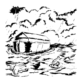
Genesis 7:1-7, 11-17, 22-24 <sup>1</sup>Then the LORD said to Noah, "Come into the ark, you and all your household, because I have seen that you are righteous before Me in this generation. <sup>2</sup>You shall take with you seven each of every clean animal, a male and his female; two each of animals

that are unclean, a male and his female; 3also seven each of birds of the air, male and female, to keep the species alive on the face of all the earth, 4For after seven more days I will cause it to rain on the earth forty days and forty nights, and I will destroy from the face of the earth all living things that I have made." 5And Noah did according to all that the LORD commanded him. 6Noah was six hundred years old when the flood of waters was on the earth. 7So Noah, with his sons, his wife, and his sons' wives, went into the ark because of the waters of the flood.