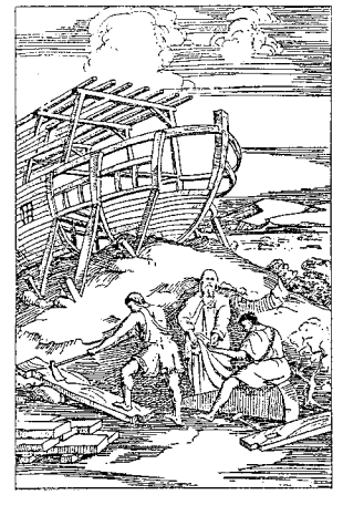
Genesis 6:5-9, 13-14, 22 <sup>5</sup>Then the LORD saw that the wickedness of man was great in the earth, and that every intent of the thoughts of his heart was only evil continually. <sup>6</sup>And the

LORD was sorry that He had made man on the earth, and He was grieved in His heart. 7So the LORD said, "I will destroy man whom I have created from the face of the earth, both man and beast, creeping thing and birds of the air, for I am sorry that I have made them." *But Noah found grace in the eyes of the LORD. 9... Noah was a just man, perfect in his generations. Noah walked with God.