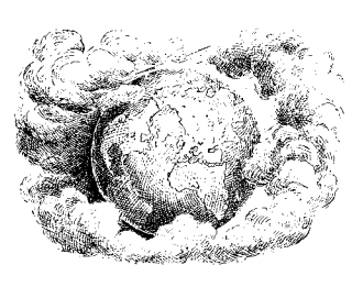
Genesis 1:1-28, 31

¹In the beginning God created the heavens and the earth. ²The earth was without form, and void; and darkness was on the face of the deep. And the Spirit of God was hovering over the face of the waters. ³Then God said, "Let there be light"; and there was light. ⁴And God saw the light, that it was good; and God divided the light from the darkness. ⁵God called the light Day, and the darkness He called Night. So the evening and the morning were the first day.