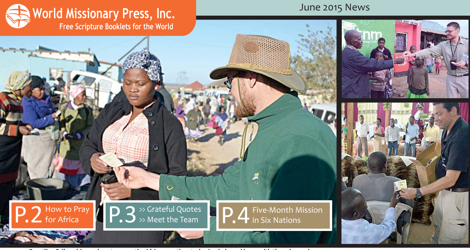
Frontline Fellowship workers traverse the African continent, sharing help and hope with those in need.