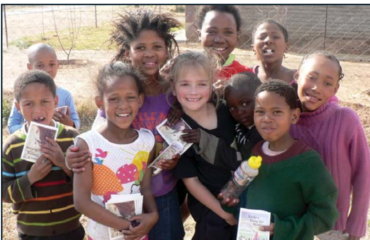
During an outreach in Botsobello, South Africa, these energetic young people received special 2-in-1 Scripture booklets containing Help From Above and The Way to God.

[A gift of $100 will reach more than 2,000 people with a Scripture booklet in their own language. An investment of $1,000 will touch more than 20,000 lives with the seed of God's Word.]