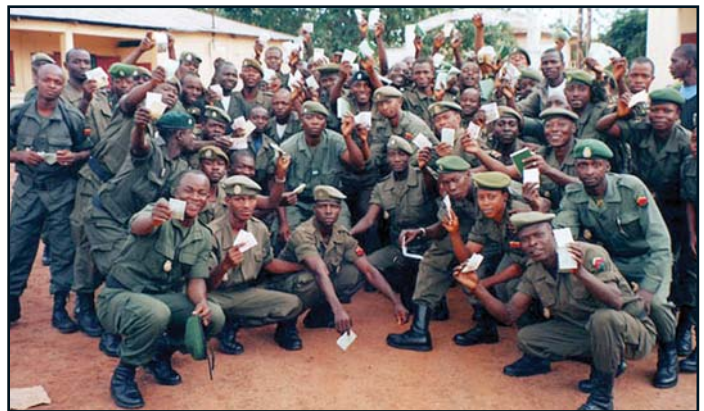
Using some of the 620 boxes of WMP material, distributor A. K. of Guinea and team did significant distribution among these soldiers at a base in N'Zerekore, Guinea.