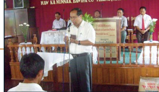
During a special service, Help From Above in a new language, Zangiat, was dedicated for use in Myanmar.