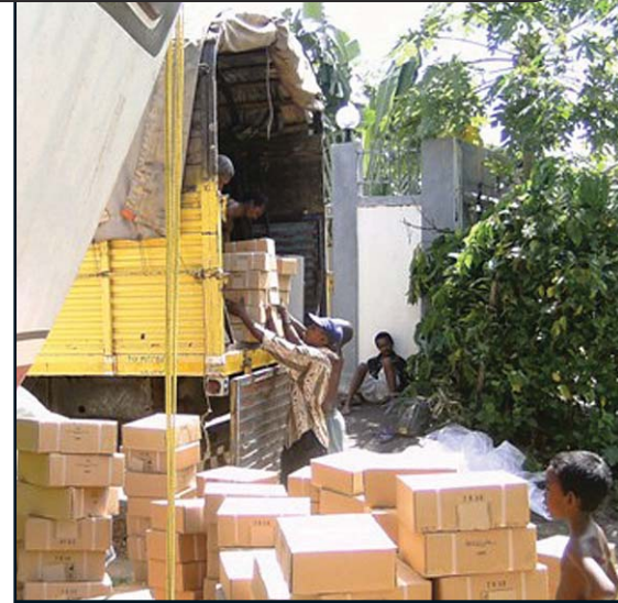
Offloading a container in Madagascar

Sometimes seeds are sown around a kitchen table, sometimes in a busy street market, sometimes along remote moun-