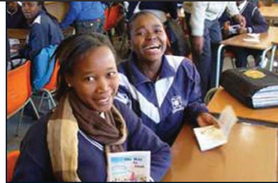
Schoolgirls in South Africa joyfully receive 2-in-1 Scripture booklets from EHC workers.