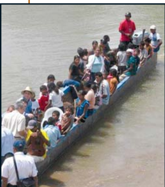
A witch transformed by Christ eagerly sets out to share His love in Nicaragua (standing near back in white sweater).

At first we could not believe this was real. But after doing some checking and going through the paperwork which arrived the following Wednesday, we knew it was real. Through one man, God was providing over $900,000—the “extra” $100,000 above budget for many months to come.