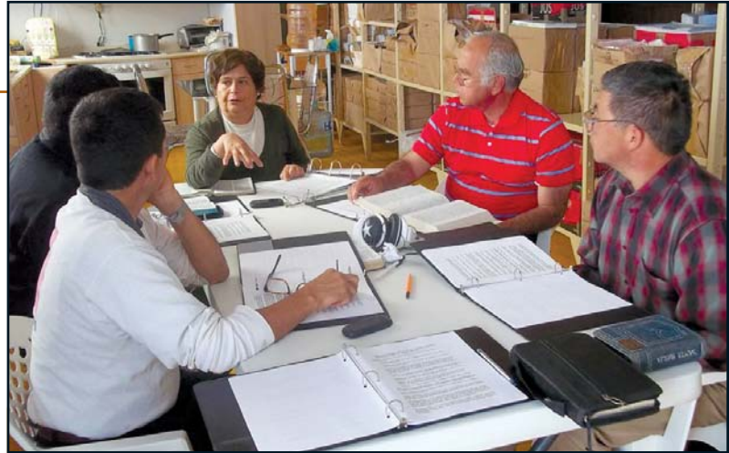
“Incredible spiritual revival” in Mexico and increased networking opportunities have spurred WMP to provide more materials to EHC workers (above) and others to reach all of Mexico.

That week we shared with the staff a DVD which had impacted us at a business leaders seminar we attended in July.