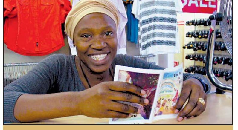
This South African lady has just received Christ as her Savior.

(Year of Great Increase, continued from page 1)