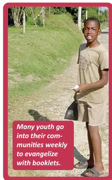
Many youth go into their communities weekly to evangelize with booklets.