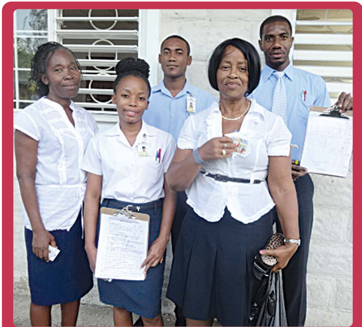
Students form teams for home to home community religious surveys. They give WMP Scripture booklets, and offer WMP Bible studies to those wanting to know more.