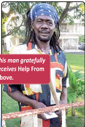
This man gratefully receives Help From Above.