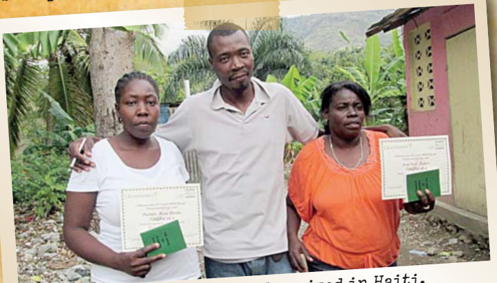
WMP New Testaments are highly prized in Haiti.