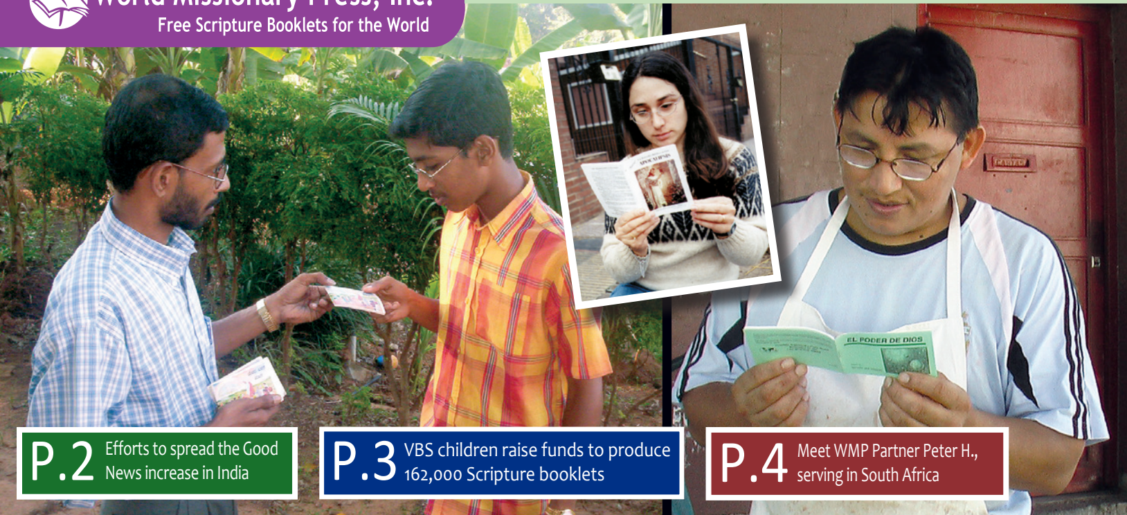
P.2 Efforts to spread the Good News increase in India