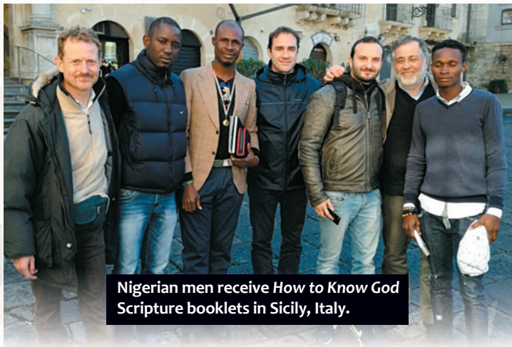
Nigerian men receive How to Know God Scripture booklets in Sicily, Italy.

In the past year WMP sent 110,526 Scripture booklets to Italy. A distributor in Naples who orders regularly has received 12,450 Scripture booklets in the past year. “We are involved in a church planting project in Naples, and where we work there are foreigners,” wrote Luca I. “We are reaching out to the community by doing a weekly book table and giving out free Christian literature, including your booklets, which are really appreciated when people see that it’s written in their own language. ” Their most recent order included booklets in eleven languages.