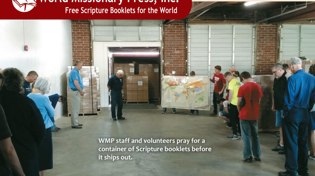
WMP staff and volunteers pray for a container of Scripture booklets before it ships out.