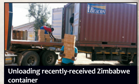
Unloading recently-received Zimbabwe container