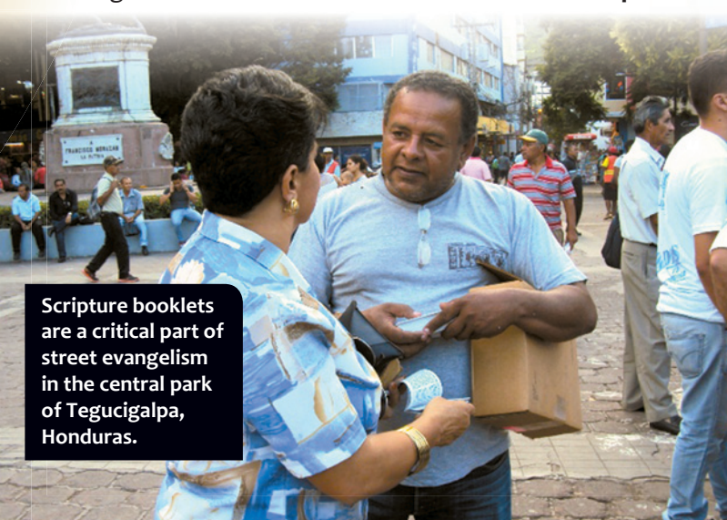
Scripture booklets are a critical part of street evangelism in the central park of Tegucigalpa, Honduras.