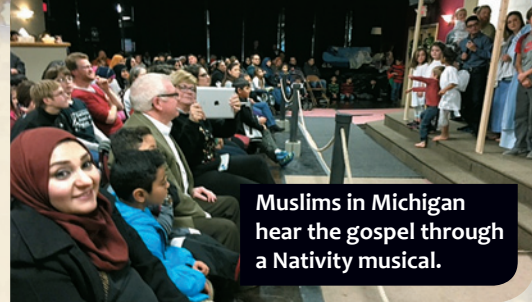
Muslims in Michigan hear the gospel through a Nativity musical.

decisions to follow Jesus, and the following evening about 150 Muslims attended the Nativity Musical in a Dearborn church, wanting to hear the Christmas story. It was the best response we have seen in ten years!