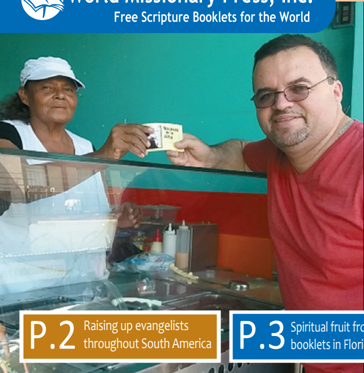
P.2 Raising up evangelists throughout South America