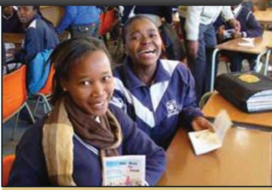
Schoolgirls in South Africa joyfully receive 2-in-1 Scripture booklets from EHC workers.

Africa. She asked them to please pray that God would supply funds to print the equivalent of 9,000,000 Scripture booklets each month. To increase production from 5,000,000—after all overhead was paid we would need $25,000 for each additional million produced and shipped.