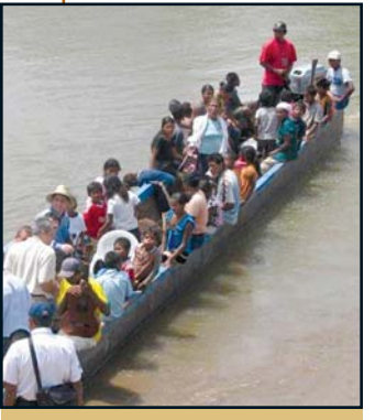
A witch transformed by Christ eagerly sets out to share His love in Nicaragua (standing near back in white sweater).