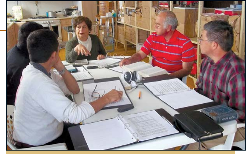
"Incredible spiritual revival" in Mexico and increased network ing opportunities have spurred WMP to provide more materials to EHC workers (above) and others to reach all of Mexico.

That week we shared with the staff a DVD which had impacted us at a business leaders seminar we attended in July.