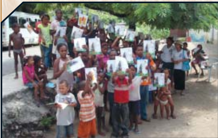
Children and parents alike in Dominican Republic can receive Jesus as their Savior and learn how to walk with Him through the salvation coloring book, He Is Risen!