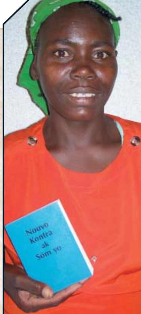
A free Kreyol New Testament with Psalms is a treasure for this Haitian lady.

We do not know what doors the Lord will open next, but we want to be prepared to meet those challenges. As with the Miskito people of Nicaragua , the Word of God will shine light into their darkness . A shipment of Spanish, Portuguese, and Ticuna Scripture booklets is bound for the Amazonia region of Colombia, Peru, and Brazil . Along that mighty river are tributaries that lead to hundreds of villages that have yet to hear the name of Jesus. In some areas those who rule by the power of their own will resist the entrance of the gospel of love, peace, and