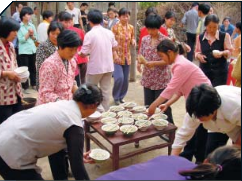
God is opening awesome doors to reach many thousands in China with God's Word, as specified funds enable WMP to proceed with printings in China. Pray for a great harvest of souls.

[You can impact people around the world through the ministry of World Missionary Press. An investment of $100 will reach 2,500 people; $50 will touch 1,250 lives. A gift of $1,000 will impact 25,000 people who need to know the love and forgiveness of God.]