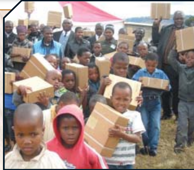
Energy and enthusiasm abound in Lesotho when a container arrives filled with boxes of Scripture booklets.