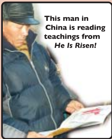
This man in China is reading teachings from He Is Risen!

World Missionary Press is still looking to the Lord for designated funds to finance urgently needed printings of WMP topical Scripture booklets and Bible-study booklets in China. The opportunities for such printings are almost limitless. These printings will be done through independent networks, each producing material for their own evangelists and churches. Churches in China are experiencing tremendous growth and are looking for assistance only in providing the extensive amount of evangelism and teaching tools needed to strengthen new believers as well as to share Christ where He is not yet known. They shine in the face of all obstacles and ask only for the tools to continue.