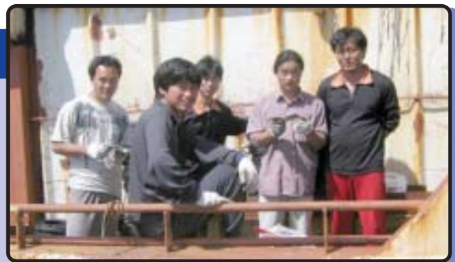
Seamen (like these) who dock on the island of Malta receive portions of God's powerful Word sent from World Missionary Press.

[Sailors from many nations can be reached with the gospel through your involvement. Every dollar helps. Every gift counts.]