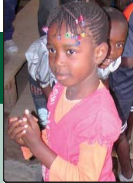
Precious children in Democratic Republic of Congo are eager to learn through Scripture booklets.

[Each box with 520 Scripture booklets costs about $20.00. Your gift can reach people in the Democratic Republic of Congo with the message of God's love.]