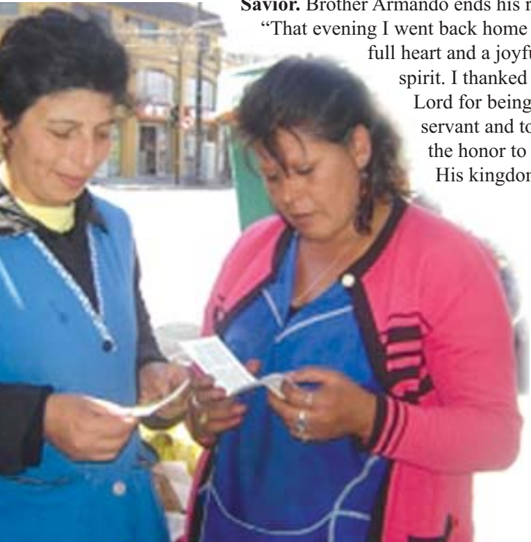
◀ Ladies in Chile read about God’s love for them and of His offer of salvation.