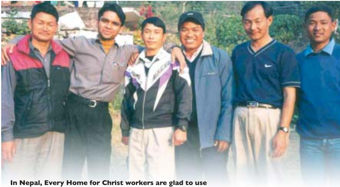
In Nepal, Every Home for Christ workers are glad to use WMP Scripture booklets in their outreaches.

[A gift of $100 will provide for 3,400 Scripture booklets to be printed in Nepal. An investment of $1,000 will provide 34,000 booklets for those under the cloud of Maoist oppression.]