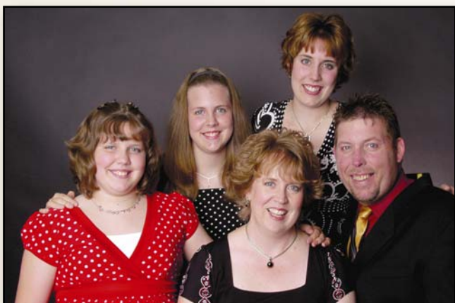
The Stutzman Family

Call (574) 831-2111 (ext. 0) for Reservations.