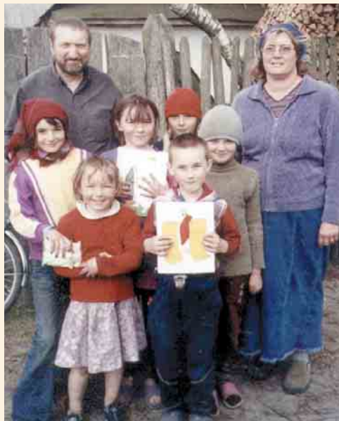
Children in Chernobyl area of Ukraine delighted in receiving He Is Risen! salvation coloring books.

“Thank you very much for the booklets you are sending us in Zimbabwe . It is our joy to tell you of the good results we are getting through these booklets in our effort to win many for Christ. Literature is a very important tool in evangelizing the world, and we are seeing the fruitful results in our town and