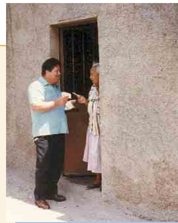
Door-to-door ministry in Venezuela to share God's Word.

No gift is too small to be appreciated nor too large to be put to good use.