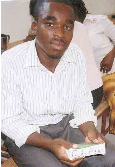
Kreyol New Testaments in Haiti are indeed "God's Power" over sin and hopelessness.

is the same. WMP will continue to provide Kreyol New Testaments for various ministries in Haiti. Orphanages, schools, clinics, and churches are crying for material to help teach Haitian people about the love of God. WMP's Bible Study on Matthew is available again in Kreyol to help establish believers in the truth. In this needy country burdened by voodoo, a battle rages for souls. We must continue to send ammunition for that battle. Our brothers and sisters in Christ