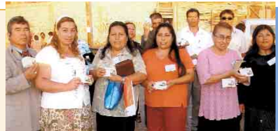
Workers in Chile prepared to distribute The Power of God Scripture booklets.