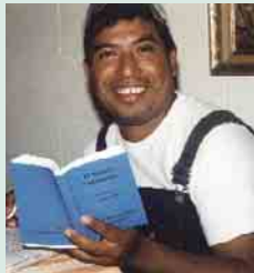
WMP Spanish New Testaments with Basic Study Supplement are helpful study tools in numerous Spanish-speaking countries.

New Testaments are needed in several languages: Spanish (for Central and South America), Kreyol (for Haiti), French (for French-speaking Africa and Haiti), Arabic (for the Middle East and North Africa), and Persian/Farsi (for Iran). These New Testaments are intended for believers in restricted areas or who cannot afford to purchase one. Most editions have a study supplement designed to help readers find verses on important topics. Printings are done as funds allow.