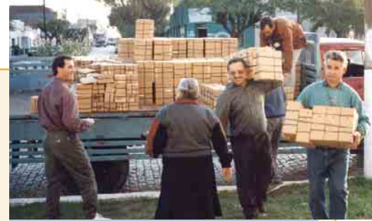
Millions of Portuguese Scripture booklets are shipped to energetic workers in Brazil.

[Every $20 donation will provide 500 Scripture booklets for people around the world; each $100 will touch lives of 2,500 people. God's Word, set loose, will accomplish what He pleases.]