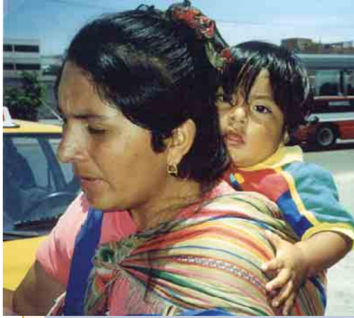
Precious families in Peru and elsewhere need opportunity to read of God's great love.

books (over 50 million total items) to 161 countries and islands. This was possible because of those who shared the vision to give the world the Word and gave—often sacrificially—to keep the presses rolling. They, too, share in bringing the women in Zambia and the Buddhist monk in Thailand to the Savior.