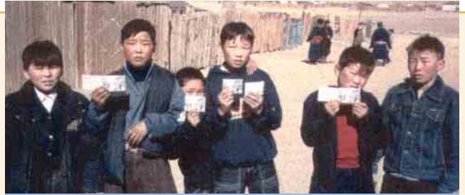
Boys in Mongolia received The Way to God .

F rom Zimbabwe came this message: “I have distributed the booklets among all believers in our church. What a joy as many began to devour the precious and encouraging words! I wish you [could] know how we hunger for the gospel here . We may be beggars of material things in Zimbabwe, but we are beggars of the Scriptures as a church. We need God in our hard times, we need the Word in our difficult moments , and therefore we thank you for providing us with this Word of God. Words alone fail to express our greatest joy . . .”