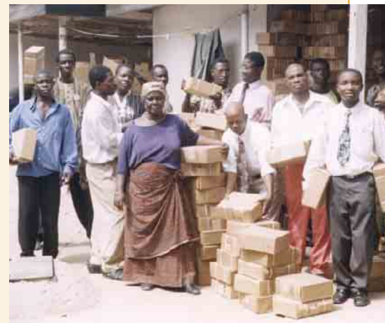
Workers in Ghana gladly use WMP Scripture booklets in their outreach activities.